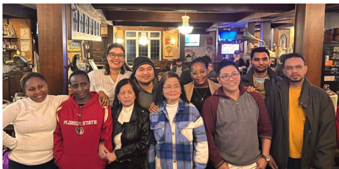
Our 10 Live-In Group Home Workers