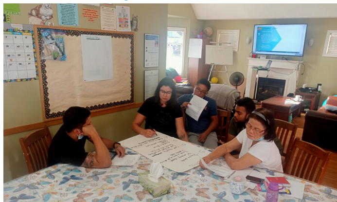
Mandt training session